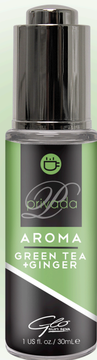
GREEN TEA + GINGER